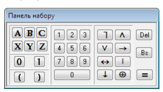
Figure 2. Panel Set of Master of Logic Program